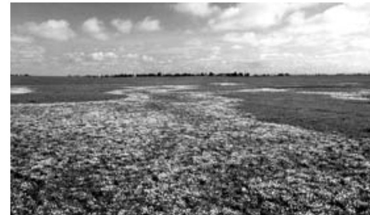
Sacramento Prairie Vernal Pool popcorn flowers in full bloom.

The project adds to the over 2000 acres of vernal pool grasslands already preserved in SVC's Sacramento Prairie Vernal Pool Area in southeast Sacramento County, just south of Highway 16, west of Sunrise Boulevard. The newly-protected 75-acre site serves as high-quality mitigation for vernal pools used for development in the Elk Grove, Laguna Ridge area.